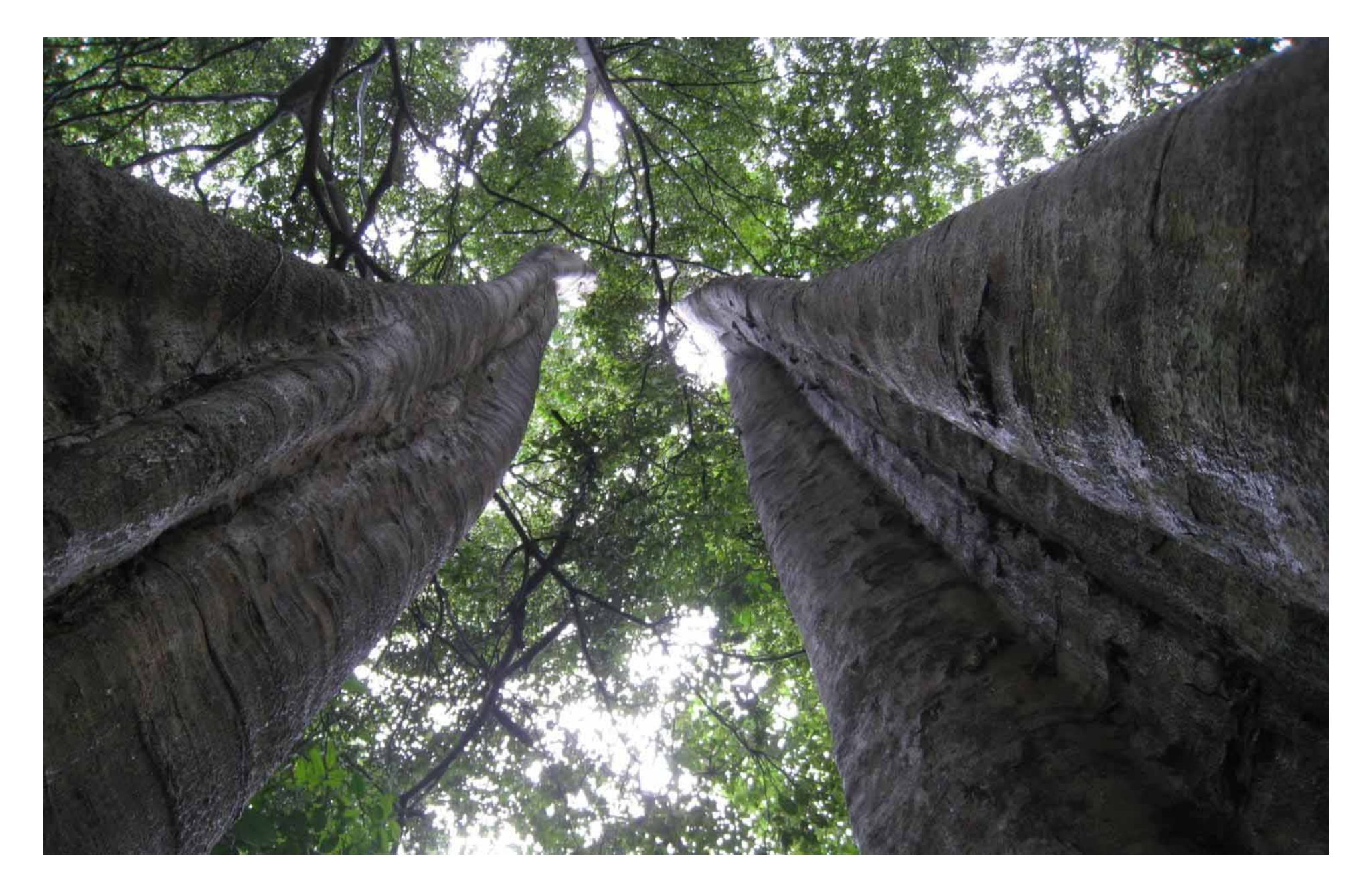
What is Initiative?