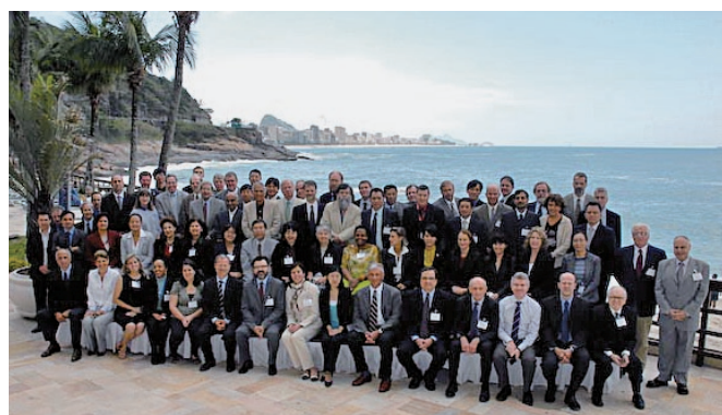
Participants of the 24th Plenary in Rio de Janeiro