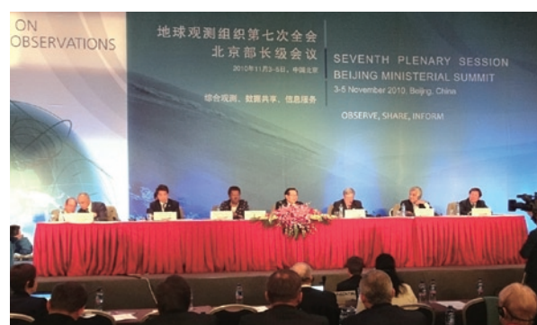
2010 GEO-VII Plenary in Beijing, China